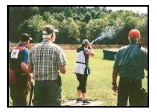
Registration begins at 8:00 am Group Pictures Shoot starts promptly at 9:00 am

The main event of the day will be a shoot held at the Pathfinder Fish & Game Club (four miles south of Fulton on Route 57).